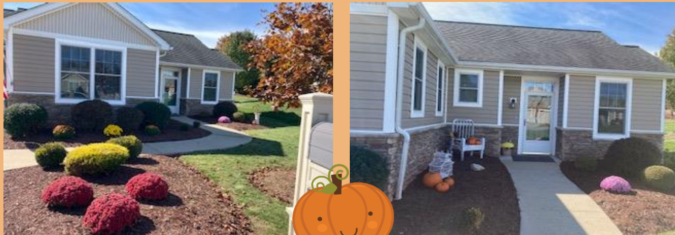
Beautiful fall landscaping at Susan Tesluk's cottage.